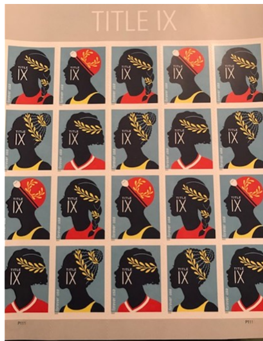
New Title IX Stamp

50 years ago, Title IX of the Education Amendments of 1972 changed the face of education. This groundbreaking civil rights law prohibits sex discrimination in education and protects people of all genders, both staff and students, in any educational institution or program receiving federal funds. Title IX ushered in an era of enormous progress for girls and women from classrooms to playing fields, but advocates continue to fight efforts to weaken it. Join AAUW as we honor five decades of advancing educational equity for all and engage where advocacy is still needed to achieve the full promise of Title IX.